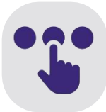
Step 1 - Selection Process