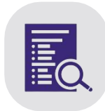
Step 2 - Aptitude Test